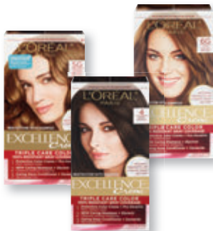
L'Oreal Excellence Creme Triple Care Color Selected Varieties

ExtraBucks® Rewards offer limit of 1 per household with card.