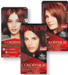
Revlon Colorsilk Haircolor Selected Varieties