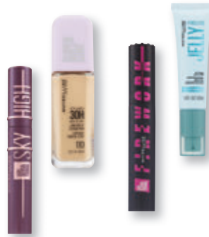
Maybelline Beauty Tools & Cosmetics Selected Varieties

Hairstyling & Haircare Selected Varieties Sale items not included