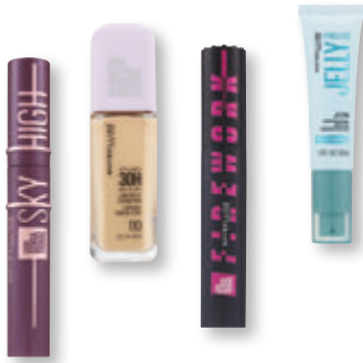
Maybelline Beauty Tools & Cosmetics Selected Varieties