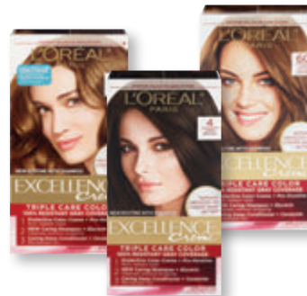
L'Oreal Excellence Creme Triple Care Color Selected Varieties