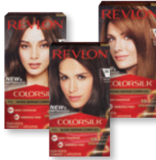
Revlon Colorsilk Haircolor Selected Varieties

ExtraBucks® Rewards offer limit of 1 per household with card.